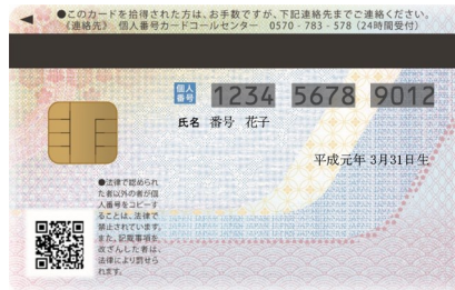
Personal Identification Number Card