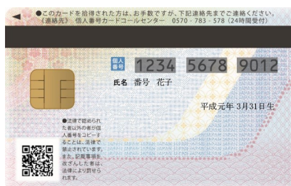
Personal Identification Number Card