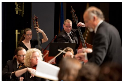
Norman Philharmonic in the middle of a spirited performance