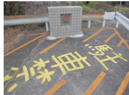
Top: The circled areas are water tank manholes. Please don't park on them! Bottom: Refrain from parking in clearly marked, prohibited areas