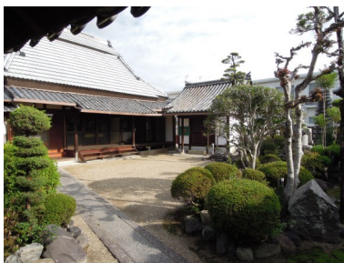
Grounds of Nyakuou-ji Temple