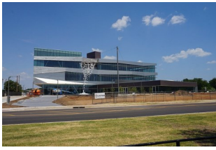
Façade of Norman Public Library Central before opening