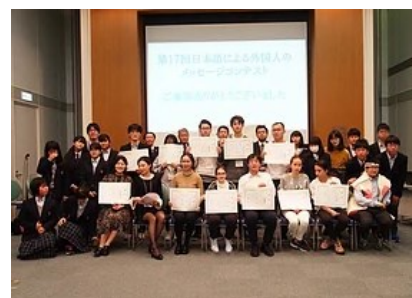
Participants of the 2019 Japanese Message Contest (held by SGN)