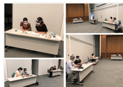
Japanese class students learning with their teachers' help

This is a playgroup where foreign and Japanese families with children can enjoy each other's company. (More info on pg. 5 of this newsletter.)