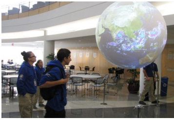
Visitors an exhibit at the National Weather Center