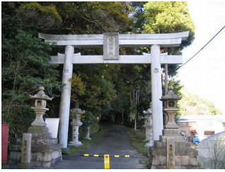
Torii gate of Shinden Shrine