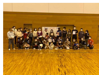
The 1st SGN Sports Day held this past October