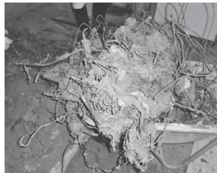
Remaining trash mound with incombustible trash and wire mixed in.

Also, in situations where thermometers, blood pressure machines, etc. containing mercury are mixed in, it is assumed to influence the disposal of exhaust gas and forces an emergency stop of the incinerator.