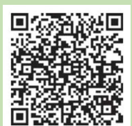
Concert details are on the town homepage

Inquiries Keihanna Fureai Concert Executive Committee (within the Planning and Coordinating Division) TEL: 95-1900