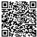
Appointments to receive your card can be made here

※Renewals for digital certificates can be made 3 months prior to the expiration date.