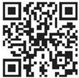
Kyoto Stage HP