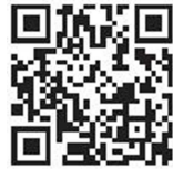
Official Race HP