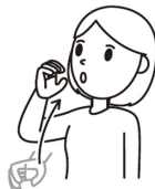
B. To Drink

Stick out the pointer and middle finger on your right hand and move forward starting just below your right eye.