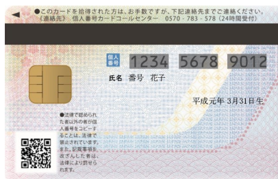
Personal Identification Number Card